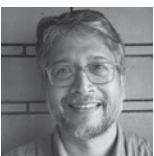
Indradeep Ghosh Dvara Research