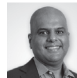
Venkatesh N Samasta Microfinance